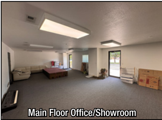
Main Floor Office/Showroom

1327-1331 S. Garfield Ave., Loveland, CO