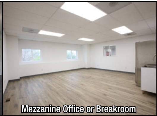
Mezzanine Office or Breakroom