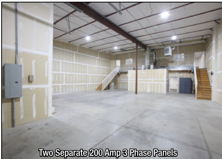
Two Separate 200 Amp 3 Phase Panels